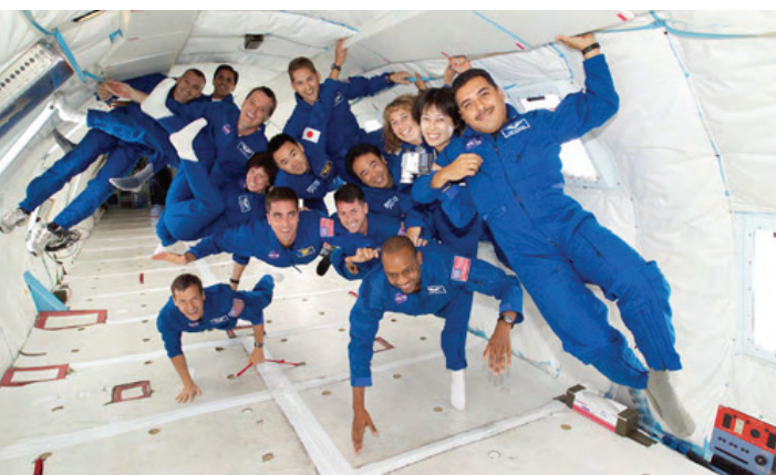
CREW TRAINING PROCESS