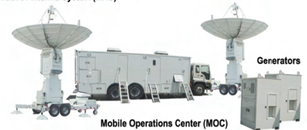
Mobile Antenna System (MAS)